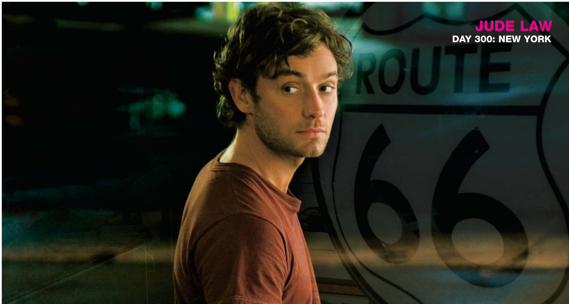
JUDE LAW DAY 300: NEW YORK